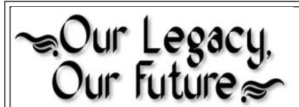
Table sponsorships are $500 and include premium reserved seating for eight, along with recognition on the table and in the presentation. Thank you to CMC Steel Texas, Guadalupe Regional Medical Center and Seguin Gazette-Enterprise . Other sponsorships include the $500 Gold Awards Sponsorships

Scheduled for Tuesday, Sept. 22, the Banquet will feature a Social Hour sponsored by American Bank of Texas followed by a delicious catered meal and a slew of inspirational awards presentations.