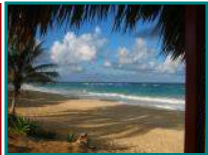
What's missing? You!