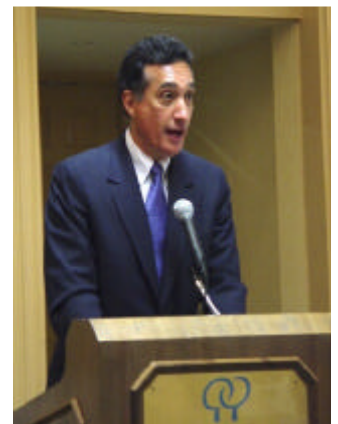
Henry Cisneros, keynote speaker, discussing the benefits of building stable economies through small businesses.

BiGAUSTIN received an outpouring of support from various sponsors in the Austin community without whose support this event could not have been such a BiG success. We'd like to extend a hearty thanks to our sponsors (see sponsors on page 4), and a special thanks to Wells Fargo Bank, 2002 Sponsor of the Year.