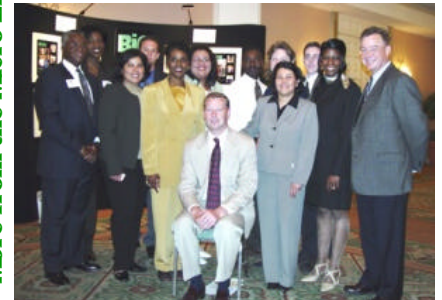
BiG staff and Board of Directors

More from the Micro Enterprise of the Year Awards Luncheon