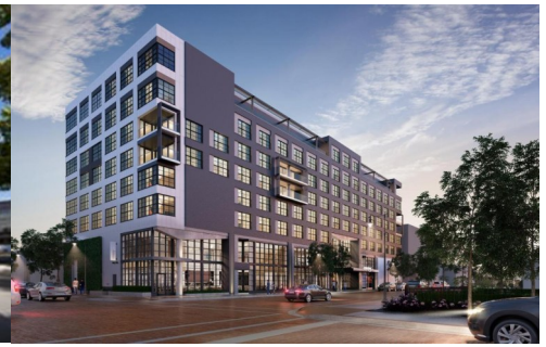
Canopy by Hilton - Grand Rapids, MI