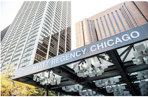
Hyatt Regency - Chicago, IL