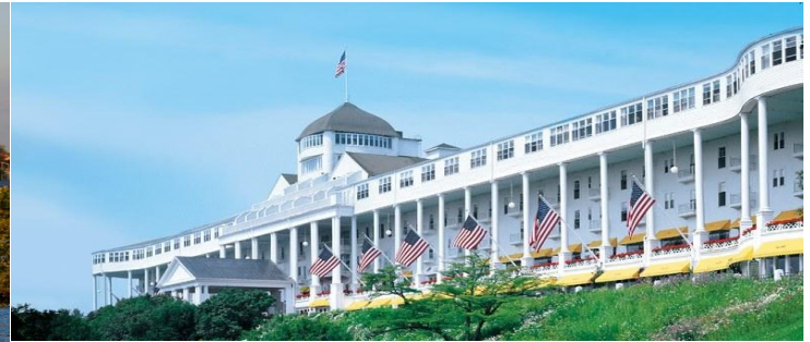
The Grand Hotel - Mackinac Island, MI