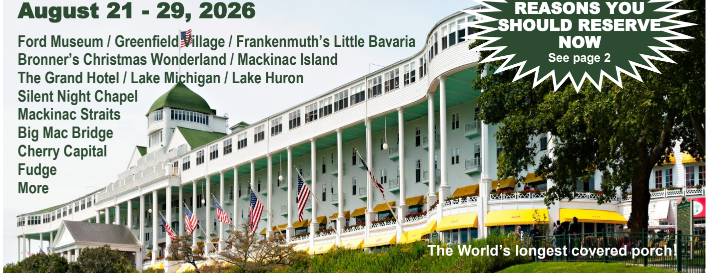
The World's longest covered porch!