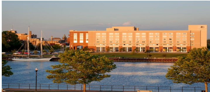
Doubletree - Bay City, MI