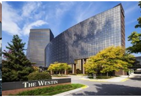
Westin - Southfield, MI