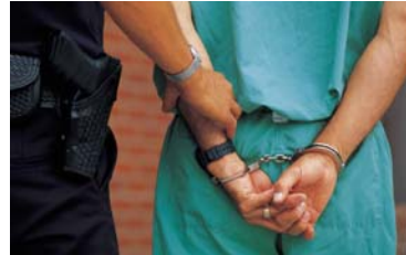
Setting the captives free!

"I am very serious about being a follower for our Lord, and I do need