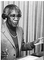
Representative Shirley Chisholm

As a child, growing up in the 60's and in the north, I had the opportunity to see the social injustices and the forces of change from a safe and comfortable distance. I did not experience living under the conditions that the children my age had to endure daily in the south, yet they were strangely a very real part of my life as well. I remember my mother telling stories of what she experienced as a child