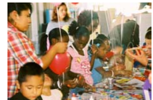
Building strong families through outreach, training, and family activities. Wholly Committed Ministries working to see families restored.