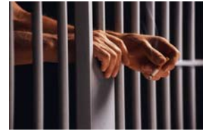
Wholly Committed Ministries is working to break the generational cycle of emotional, spiritual, and physical im-

Many women are asking for women pen pals. Please consider being a pen pal. Call Sheila Green at (512) 636-1381 training is provided.