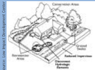
LID Lot Level Source Controls

Water moving through these systems is slowed, filtered, and percolated into the ground. These systems can act as low cost alternatives to curbs, gutters, and pipes.