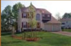
Residential Lot with Bioretention

Ever wish you could simultaneously lower your site infrastructure costs, protect the environment, and increase your project's marketability? With LID techniques, you can. LID is an ecologically friendly approach to site development and storm water management that aims to mitigate development impacts to land, water, and air. The approach emphasizes the integration of site design and planning techniques that conserve the natural systems and hydrologic functions of a site.