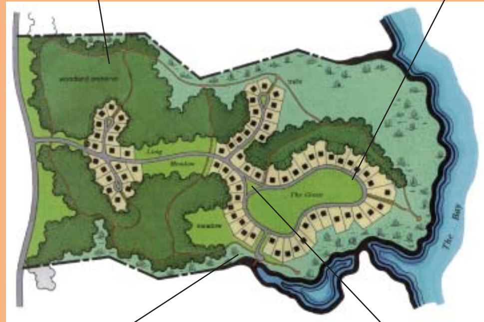
Grassed Swales Somerset Development Prince George's County, MD