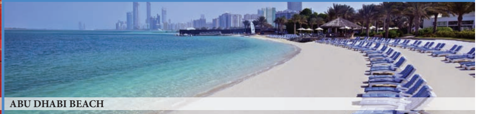
ABU DHABI BEACH