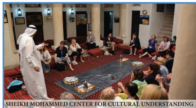
SHEIKH MOHAMMED CENTER FOR CULTURAL UNDERSTANDING

After breakfast, start your tour to the UAE's east coast to see the variety of landscapes the country has to offer. Drive through the lush green agricultural area of Dhaid and then on to the Hajar Mountains, which offer a beautiful natural backdrop. Stop at a market with examples of locally made pottery, fruits and carpets. Continue through the scenic mountains and wadis (dry river beds), past the Masafi (home to famous natural springs) to the Indian Ocean. In Dibba, visit a local fish market with its abundant and colorful catch. Continue along the coast through fishing villages to the Bidaya Mosque, the oldest mosque in the UAE. Then on to Khor Fakkan, a regional hotspot for diving and snorkelling, where there will be an opportunity to relax at the beach and have a refreshing swim. We'll stop for lunch in a 5-star hotel en route. In Fujairah, visit the 17th-century fort. On the way back to Dubai, there may be a chance to stop at the oasis of Bithnah and time to spend at the market in Massafi.