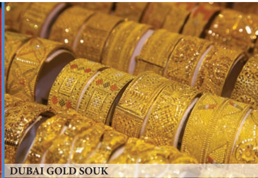
DUBAI GOLD SOUK