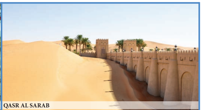
QASR AL SARAB