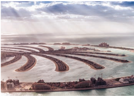
PALM JUMEIRAH ISLAND