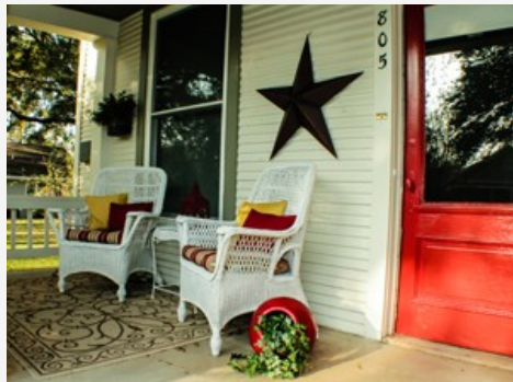
Smithville Cottage Quaint cottage where modern meets country

"Come to one trails' end, and there's always another. I kind of like it that way." - Chick Bowdrie