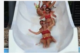
Get cool at the Summer Fun Water Park in Belton on Monday 11am-6pm Mon-Sat or Sun 1-6pm. Adult Night at the Park on August 17th, BYOB.

Nocona, TX Onalaska, TX Point, TX Plummer Printing Port Lavaca, TX