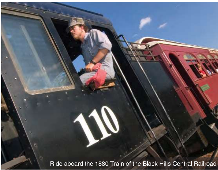
Ride aboard the 1880 Train of the Black Hills Central Railroad

Enjoy lunch on your own at the State Game Lodge before climbing aboard the park's Jeeps for a tour among the bison herd. At the Crazy Horse Memorial, a bus takes you to the base of the carving. Return to the visitor center to see the exhibits, film and enjoy and included buffet dinner. Meals: B, D