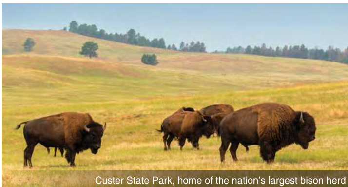
Custer State Park, home of the nation's largest bison herd

Rooms for the night before and after the tour are available. Cost for a room in Rapid City is $239, tax included.